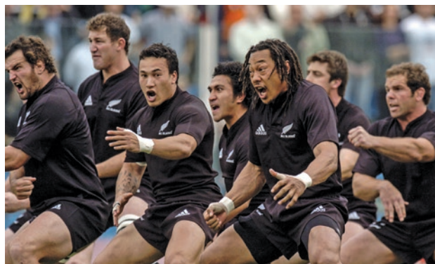
We've got no chance of winning.