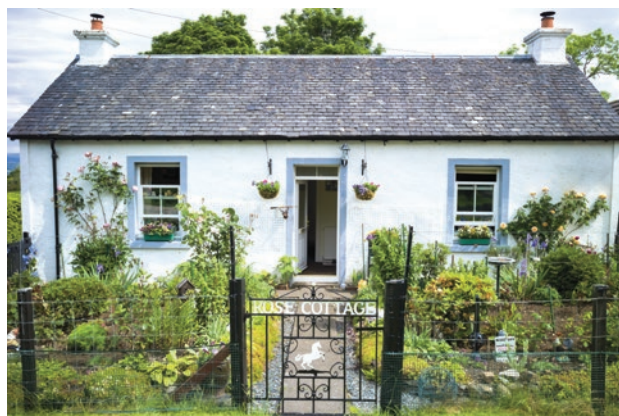
No matter where you go in life, there's no place like home.