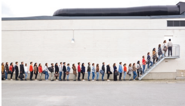
There's no sense in waiting.