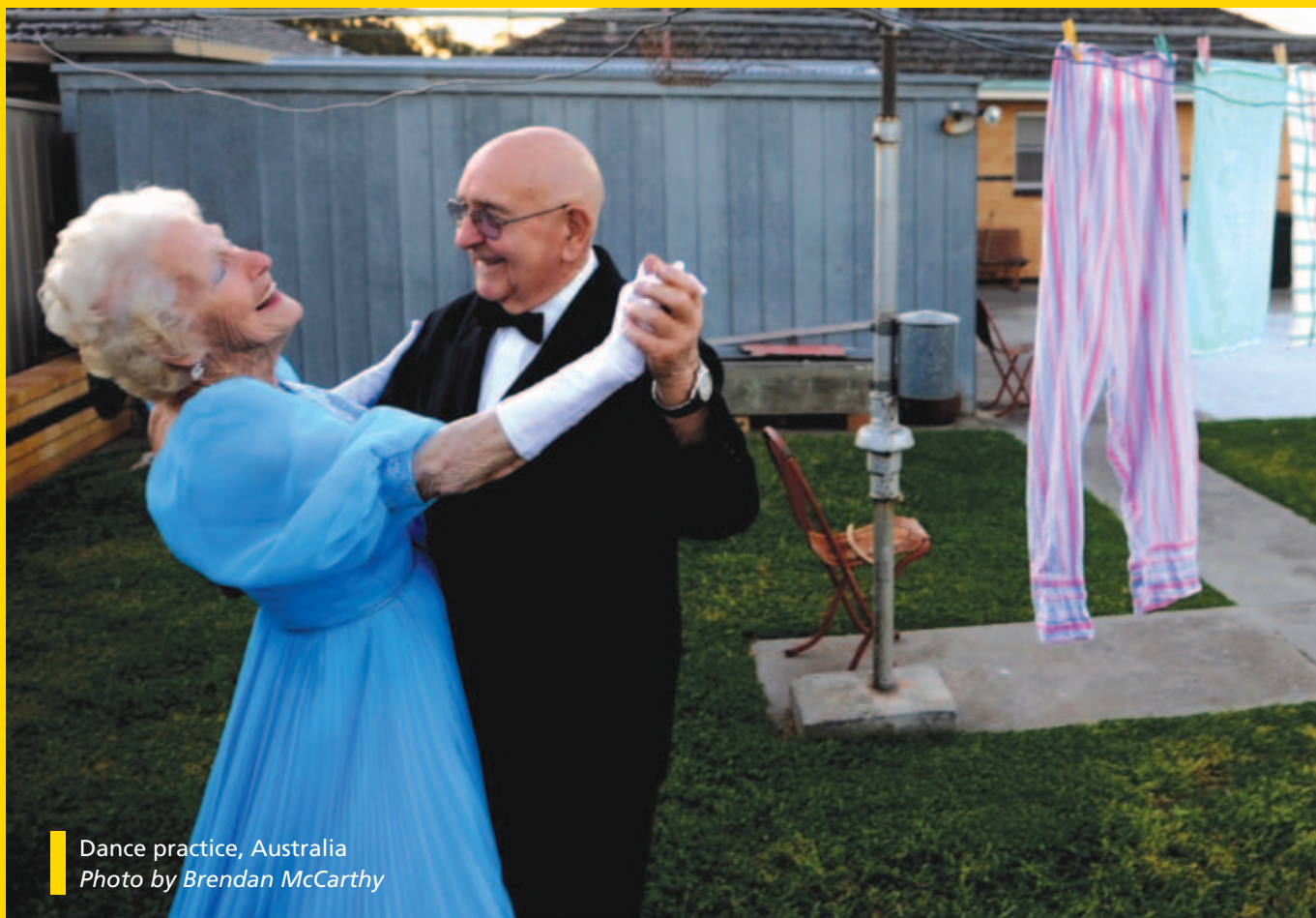
Dance practice, Australia